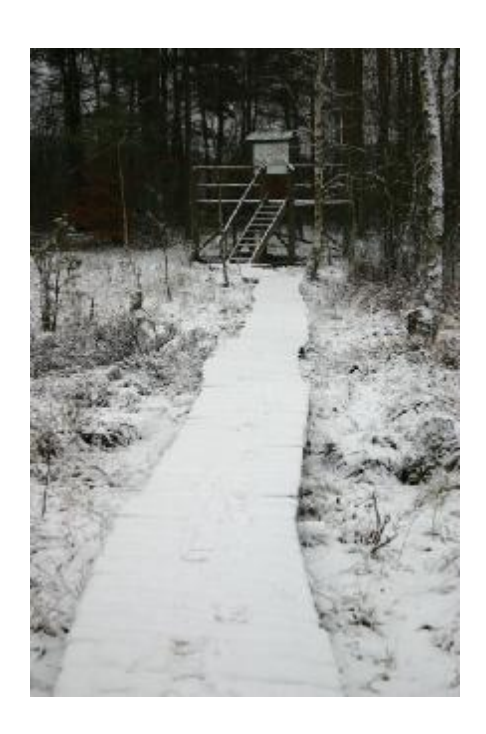
Wielkie Błoto - map of the trail .... ... wooden pavement and observation platform