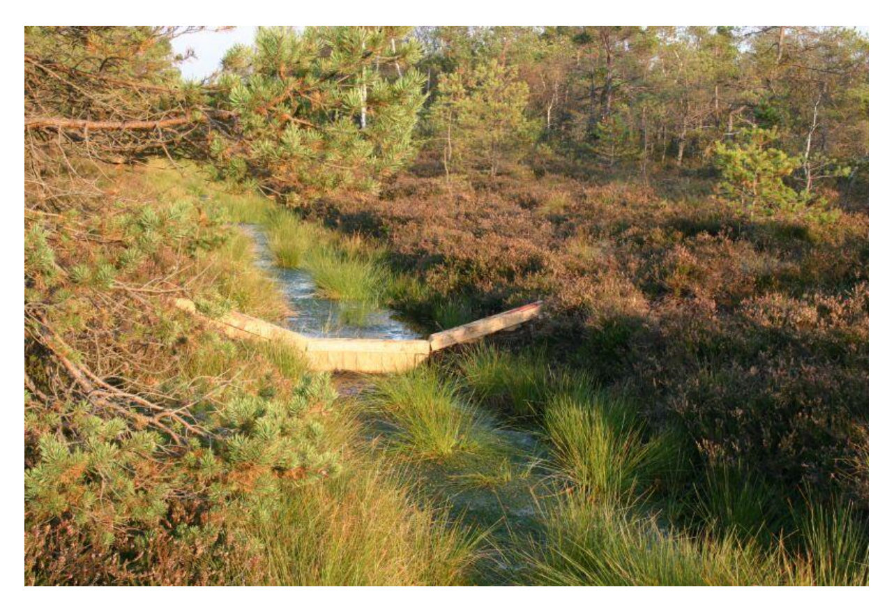
Fig: Draining ditch blocked on the Slowinskie Bog