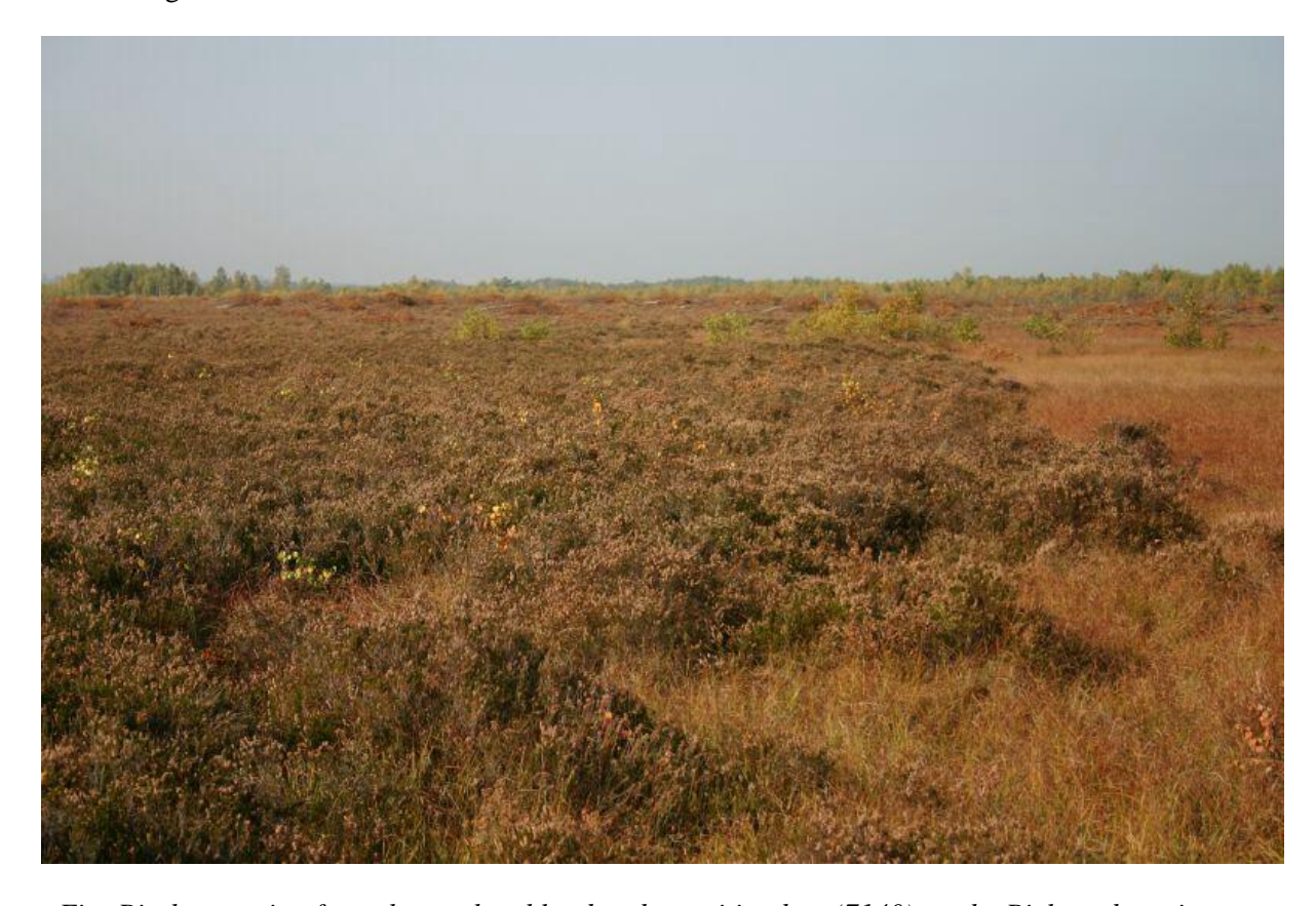
Fig: Birch removing from the wet heathland and transition bog (7140) on the Bielawa bog site Some photo documentation of the action are presented in Annex7.

As a result of executing part of this action by voluntary work, not by subcontracting, some little modification in costs categories appears (costs of volunteers travel to site, accomodation, feeding, insurance and costs of materials in place of subcontracting costs). Of course in kinds work is not included to project budget, only real costs of this work organisation.