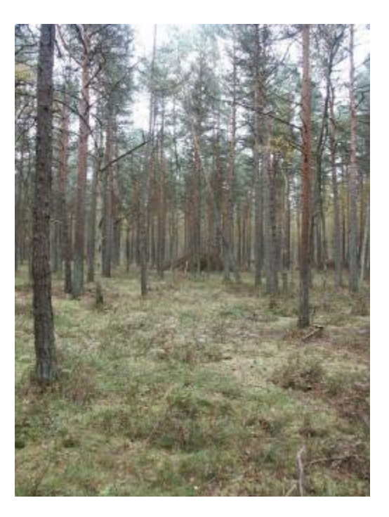
Fig. Bog forest (habitat 91D0) after removing the birch and spruce understory Ciemino Bog (site 18)

As planned, action has been subcontracted (For cutting trees specify skills are needed. Subcontracting this work in a form of public tender is easier and cheaper, than qualified workers employment. Contractors have been selected in a public tender procedures.