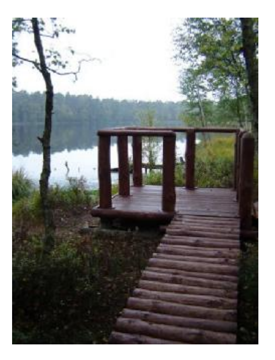
Site Karsibórz - the trail location map ... ... observation platform on the dystrophic lake bank