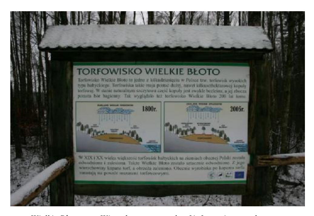
Wielkie Błoto near Wierzchowo - example of information panel