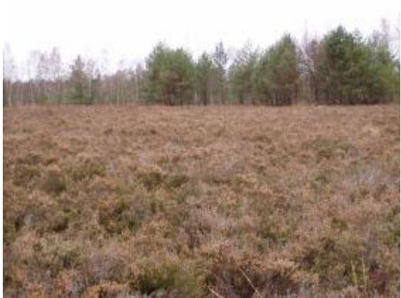
Erica locality before the action (spring 2004) ...